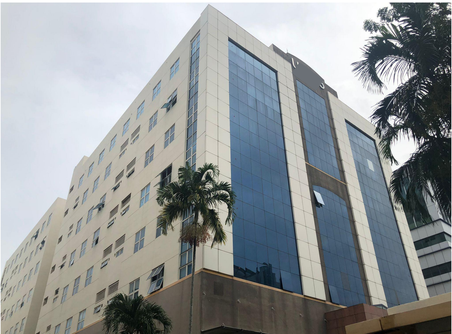
An 8-storey B1 light industrial factory