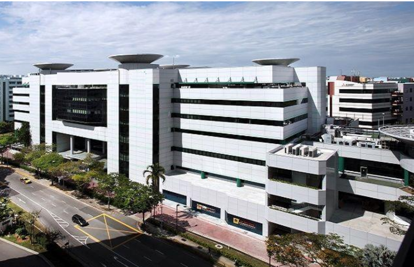
7-storey hi-specs industrial building with basement carpark