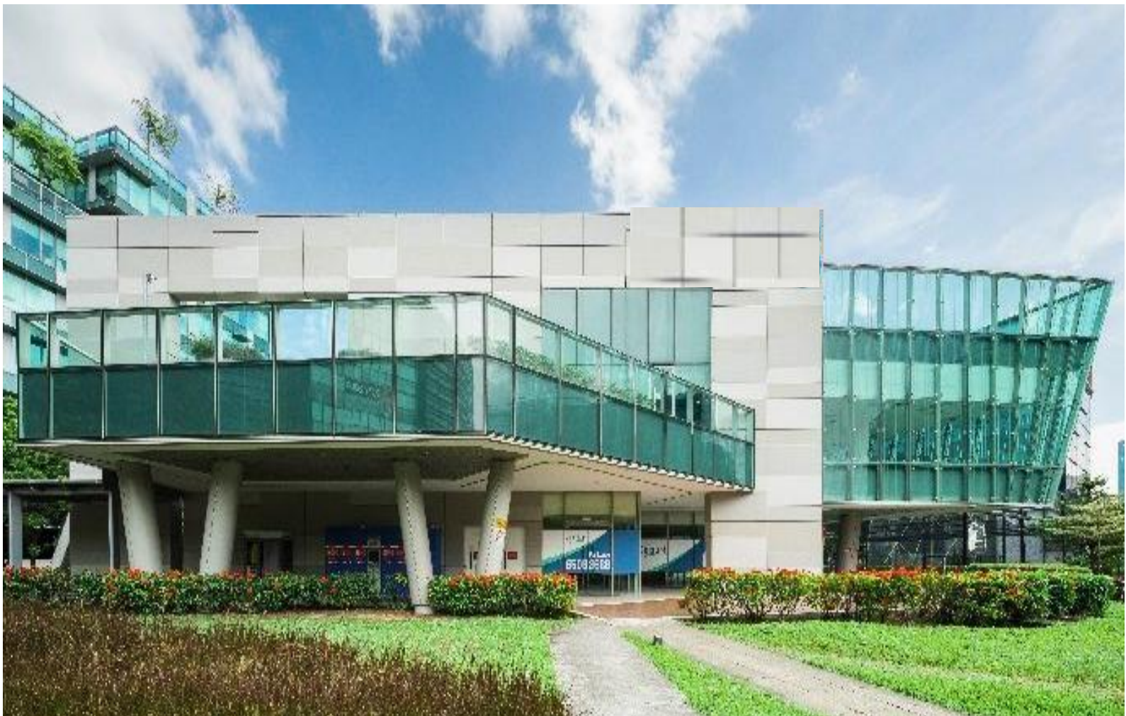
Lifestyle Hub: Business, Leisure, and Amenities in a Lush Environment

* The development provides an array of exciting amenities including food court, F&B outlets, retail shops, clinics and childcare centers.