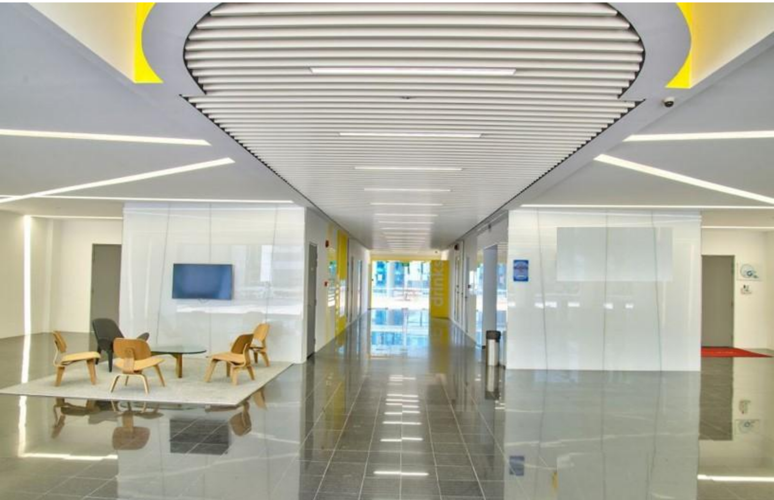
Research Building with modular column free units enabling flexible space planning and cost efficiency