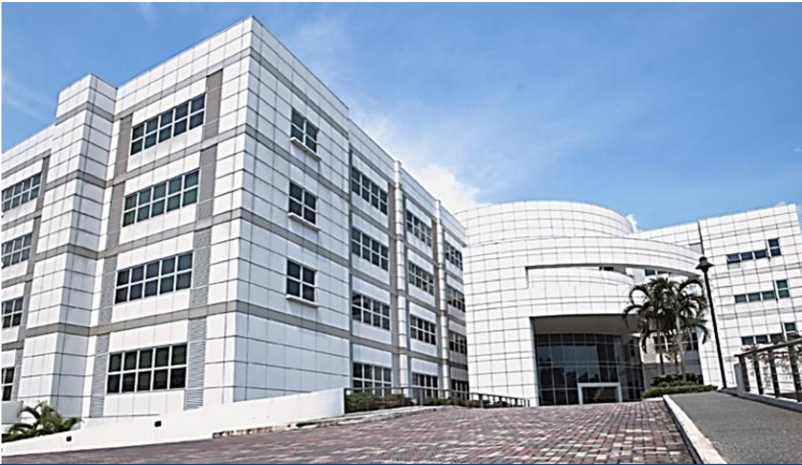
4-storey T-shaped research building with a basement carpark and roof garden