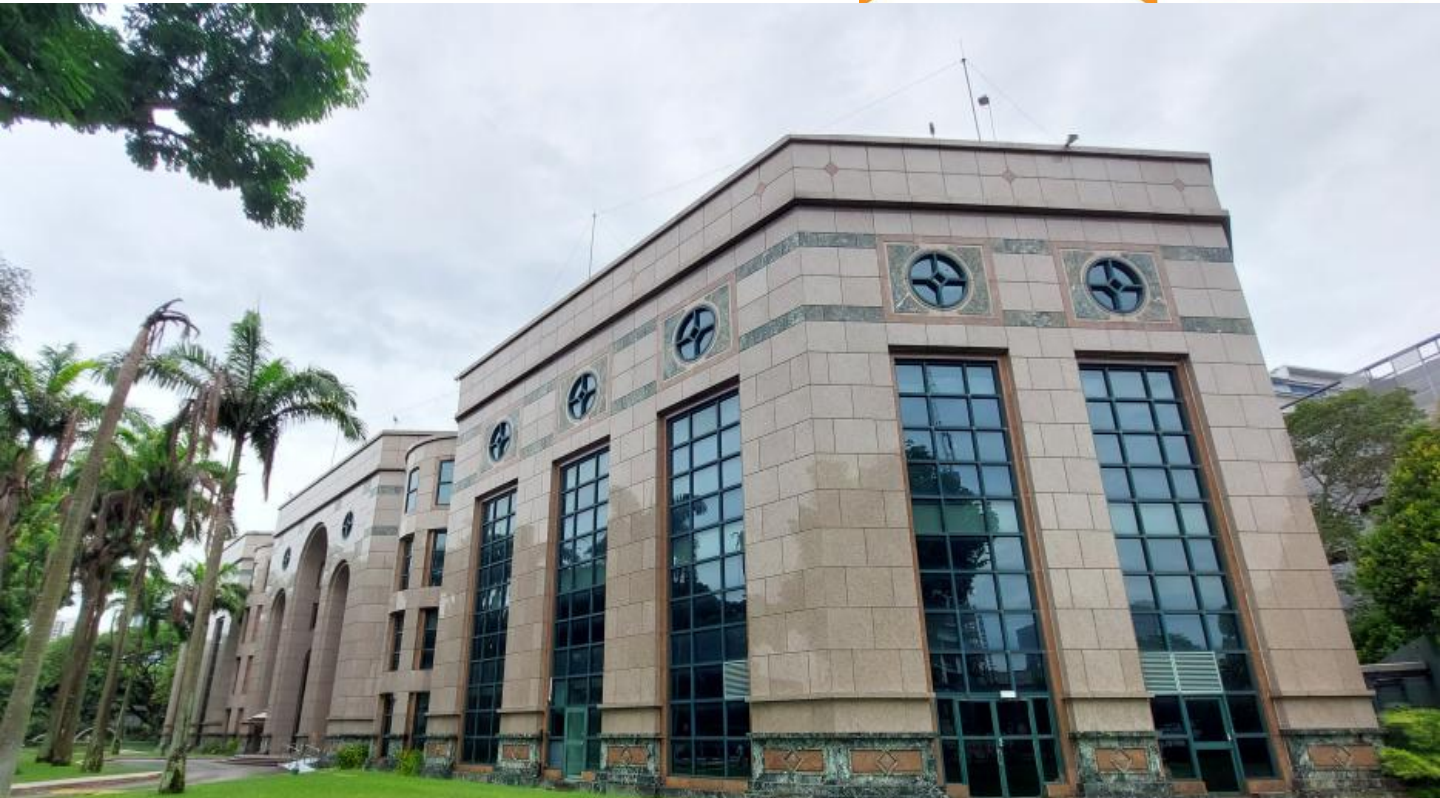
7-storey Business Park Space with Single storey F&B, Retail and Services Space